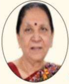
Chief Patron Smt. Anandiben Patel- Hon'ble Chancellor & Governor of U.P.

Theme: Suicide Prevention & Building Positive Mental Health